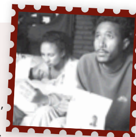
Ethiopian refugees with their asylum papers in Rome, Italy

“WE WELCOME REFUGEES INTO OUR COMMUNITIES, OUR HOMES, AND OUR LIVES. WE SHARE MEALS, STORIES, AND CELEBRATIONS. WE VISIT THEM. WE PRAY TOGETHER. WE KNOW THEIR NAMES.”