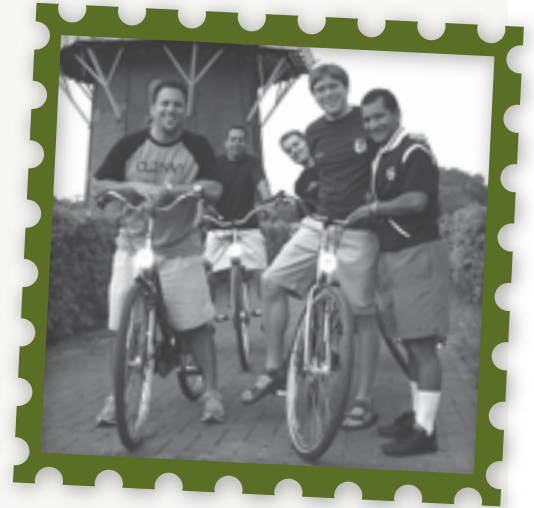
ITeams missionaries enjoying time together at the 2006 ILF in The Netherlands. View more photos of the ILF at http://flickr.com/photos/iteamsblog